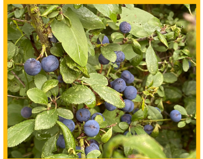
SLOES / BLACKTHORN